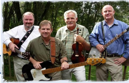
Southern Star Bluegrass