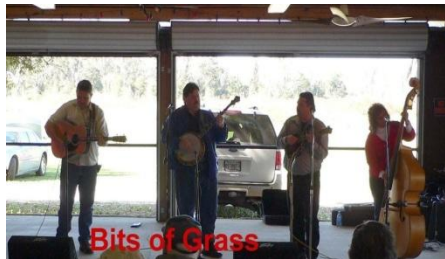
Bits of Grass