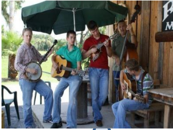
Bluegrass Parlor Band